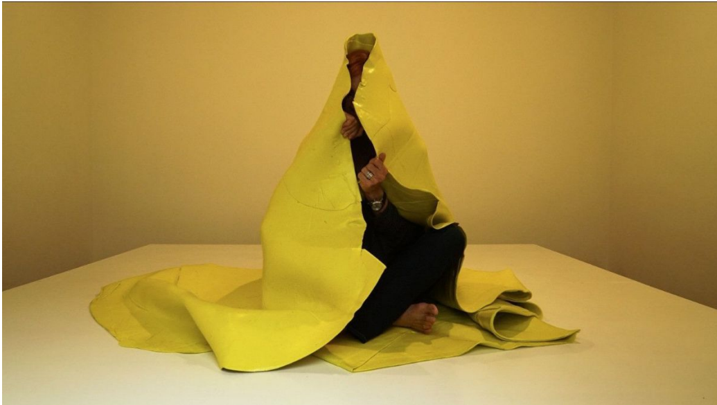
Satélite Gallery, Querétaro. México en Femenino. Artist: Berta Kolteniuk.

The transgressive nature of Swab is reflected in a programme that is committed to reflecting social problems and international policies through its proposals. All the disciplines, from the classical ones such as painting and sculpture to the more contemporary ones such as digital, performance or installation art, are used by the artist to channel and connect to the spectator. This year the majority of the works revolve around the search for and return to the roots, in a path that goes from the primitive to the digital.