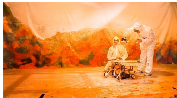
AWOL Gallery - Swab Seed -

As well as these novelties, there will also of course be the usual programmes such as the General , that for the first time includes the subsection " Emerging ", in which we will find